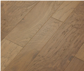
7071 Cassia Bark