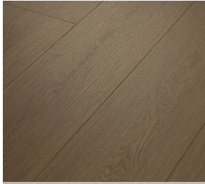
7329 Natural Umber