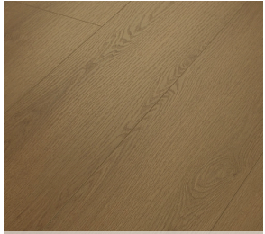
7328 Rich Cocoa