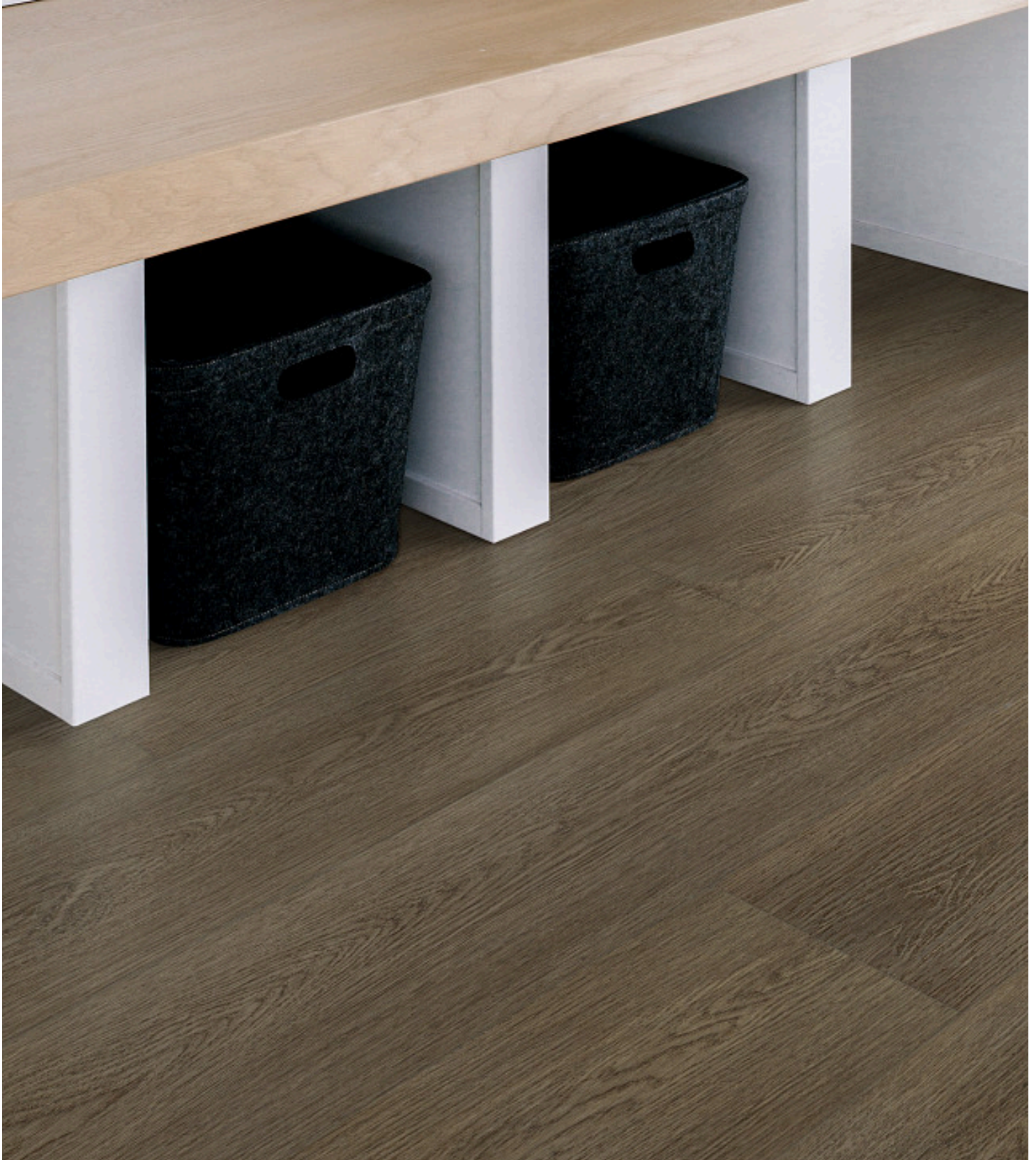
7329 Natural Umber